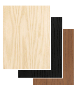
3 Ash Finishes

PET serves threefold functions on the board, offering acoustic benefits, tack-ability, and an array of tasteful colors.