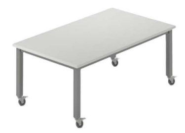
Parsons Frame Standard Height