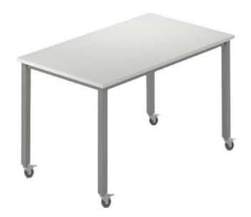
Parsons Frame Bar Height