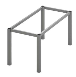
Parsons Frame Counter Height